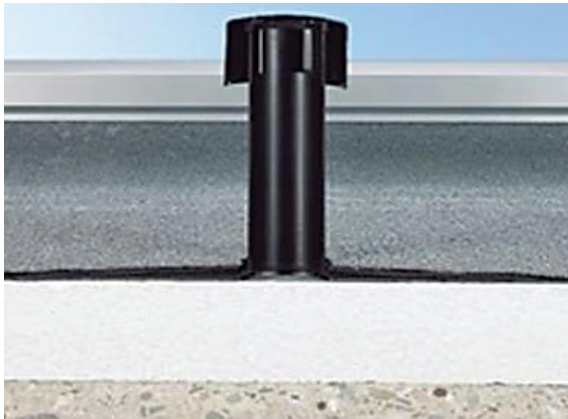
PHOTOGRAPH OF OUTLET PREPARED

Penetrations through the roof are a typical source of water ingress. They are difficult to waterproof satisfactorily in traditional materials, but can easily be formed around such details with Tecnoband reinforcing mat, again ensuring the matting is fully embedded in Accelerated Desmopol.