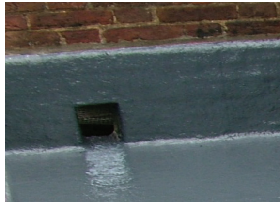
PHOTOGRAPH OF INTERNAL OUTLET

Any internal outlets, apply the system into the pipe itself, ensuring that the junction between the waterproofing and the outlet pipe is encapsulated. This will ensure that if the outlet backs up, water cannot creep under the existing waterproofing and into the building.