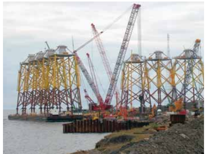
Interzone® 1000 is widely used in the offshore wind industry

www.international-pc.com pc.communication@akzonobel.com